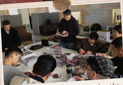
The team putting together DVDs & study guides to take to countryside Mongolian pastors.

VISIT WWW.AMONGFOUNDATION.COM . TO LEARN MORE ABOUT AMONG AND EAGLE TV.