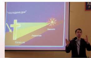
UTILIZING THIRD MILLENNIUM MATERIALS

Christian, he worked closely with several missionaries to understand the gospel more clearly. He was invited to study at Ukrainian Biblical Seminary and graduated in 2000. He went on for further study in the United