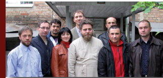
BUILDING BRIDGES WITH THE ORTHODOX CHURCH IN KIEV

States at Reformed Theological Seminary in Jackson, Mississippi, graduating in 2003 with a Th.M. degree in intercultural studies.