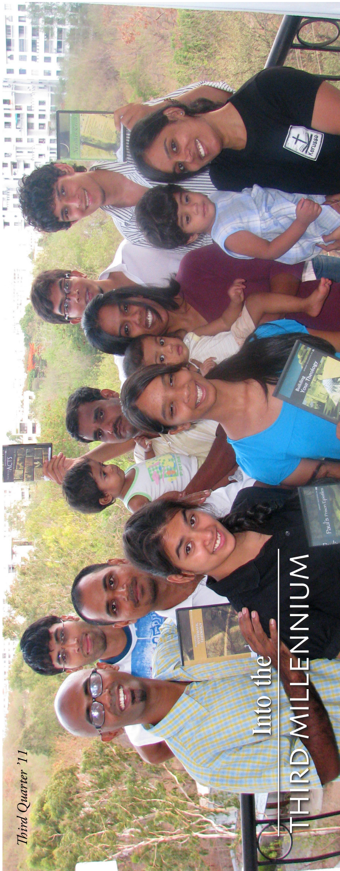
Third Quarter '11