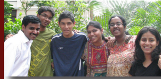
PART OF THE CHRISTIAN COMMUNITY AT KERUSSO