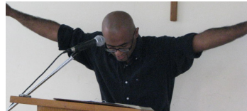
THE "CROSS-EYED PASTOR"

those penned by conservatives, the books are, at best, shallow. There is no theological undergirding for the layman. He picks the Bible and looks at it like a baptized voodoo text that is mystical and supernatural. He expects the text to come alive like a shaman offering his services to the gods. There is absolutely no framework based on which even the best of them interpret and preach/teach the Scripture.