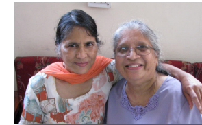
SHARING CHRIST IN INDIA